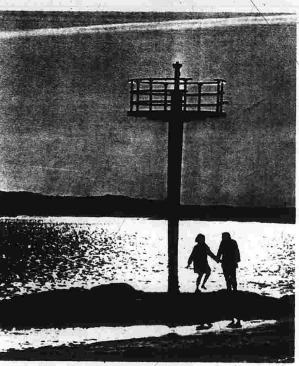
Creating a shore silhouette, a young couple holds hands on a chilly off-season day at Ocean Beach Park in New London, Conn.